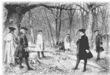
Hamilton and Burr duel

On July 11, 1804, Hamilton and Burr met in a pistol duel at Weehawken, New Jersey , in which Hamilton sustained a mortal wound.